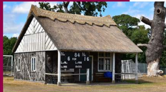
PRESENT: THE NEW THATCH WAS COMPLETED IN SUMMER 2022