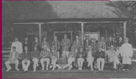
PAST: THIS PHOTO FROM 1901 FEATURES AN ENGLAND 11 WHO PLAYED WOOLVERSTONE PARK CRICKET CLUB.