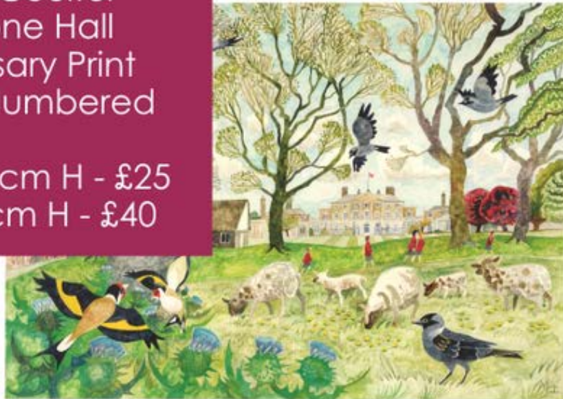
IPSWICH HIGH SCHOOL for GIRLS, WOOLVERSTONE Reproduced from an original watercolour by Michael Coulter in celebration of the 20th anniversary of the school's move to Woolverstone Hall.

43cm W x 32.5cm H - £25 57cm W x 43cm H - £40